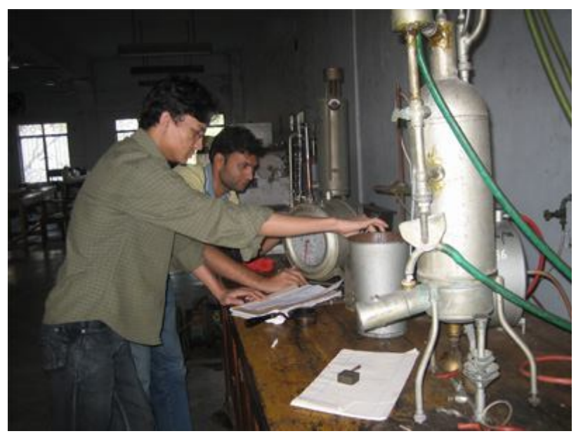
Students Performing Experiments in Fuel Testing Laboratory