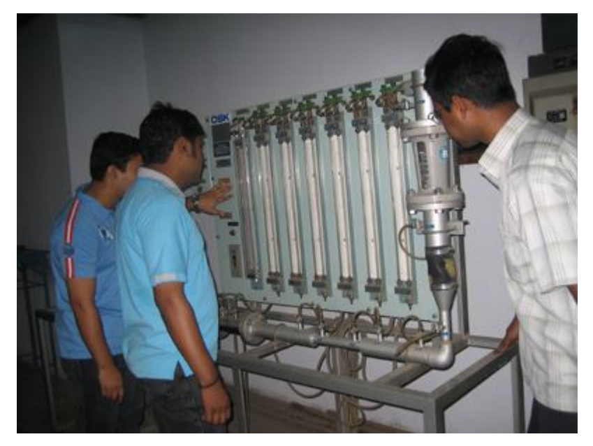
Students Performing Experiments in Fluid Mechanics Laboratory

Mechanical Engineering is generally understood to emphasize on energy, including its transformation from one form to another, its transmission, and its utilisation, and on applied mechanics, and design. The mechanical engineering undergraduate and graduate programmes provide excellent technical background for persons who want to work in fluid mechanics and heat transfer, environmental pollution control, and other multidisciplinary professions where a good understanding of technology is often very important. Throughout the study programmes, considerable emphasis is placed on the development of systematic procedures for analysis and design, and on the responsible use of technology.