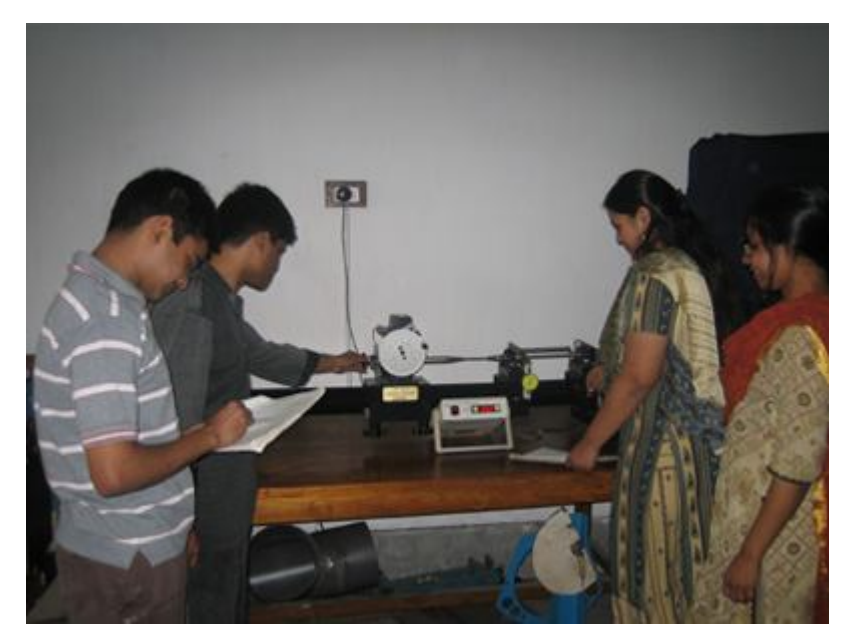
Students Performing Experiments in Applied Mechanics Laboratory