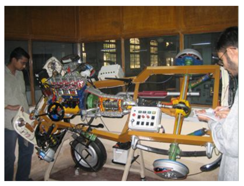
Students are studying in Heat Engine Laboratory

The department is organized into three major divisions: Thermal Engineering, Fluid Mechanics, and Applied Mechanics. A fourth division, Computation and Instrumentation, has recently been introduced to help the other three divisions with computational problems and designs. Each division maintains its own laboratories. The Thermal Engineering division covers the areas of thermo-sciences, applied thermodynamics, energy systems, heat transfer, and pollution control. The Fluid Mechanics division offers courses and specialized work in the areas of fluid mechanics and machinery in general, and fluid dynamics, and experimental and computational fluid mechanics in particular.