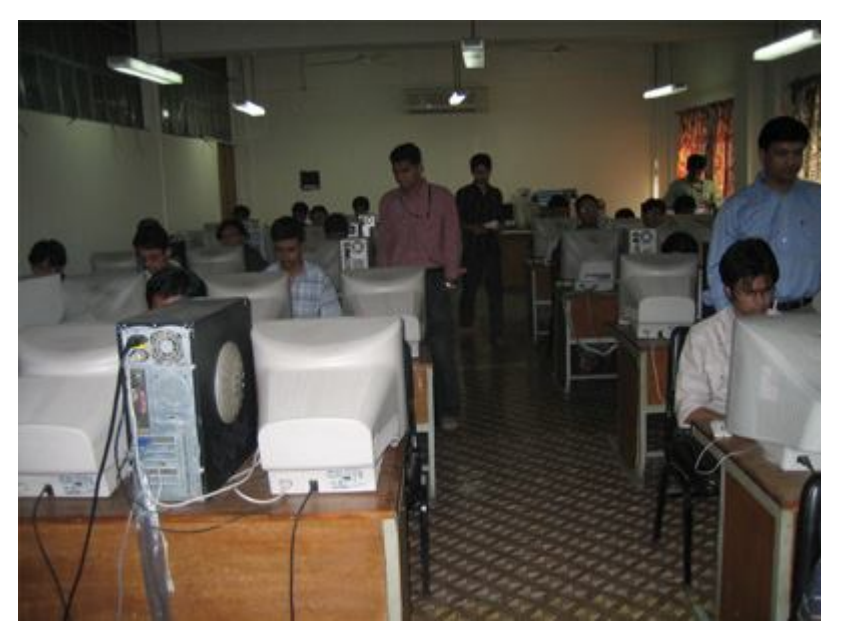
Undergraduate Computer Laboratory