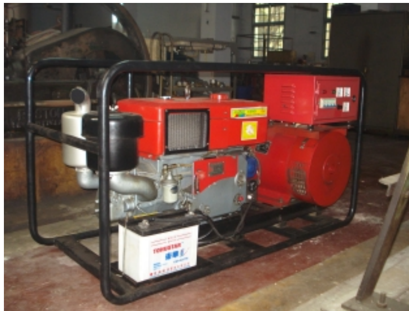
20 kW Diesel Genset

The unit could be switched to run on dual fuel mode, using compressed natural gas available in CNG cylinder as main fuel and diesel as pilot fuel. A low pressure CNG system with an integrated pressure reduction device is being developed. Easily de-touchable low pressure hosing will be used for gas delivery, while standard high pressure dispensing nozzle can be used for refilling CNG. This will allow easy and safe refilling of the system without disturbing the generator-set. Gas fumigation technique will be used to run the unit with minimum possible hardware modifications. A bank of electric heaters will be used to simulate electrical loads. Performance tests will be carried out for the entire range of engine loads running the engine with diesel only and in dual fuel mode. Comparison of the performance results and optimization of the natural gas replacement in dual fuel mode will be carried out. A cost analysis will be made for both the modes of operation in order to investigate the economic feasibility of dual fuel conversion of diesel engines of this category.